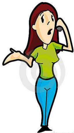
"I'm sorry, Richard, but you've failed to provide me with a male heir."